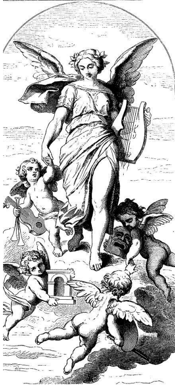
The Introduction of the Arts by Moritz Schwind taken from The Schools of Modern Art in Germany by Atkinson, J. Beavington p.131